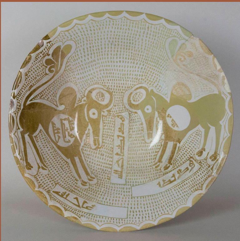
Image: Luster Bowl, 9th-10th century, excavated in Ray, origin southern Mesopotamia. Max. Diam. 32.28 cm. Penn Museum, Object Number NEP79B