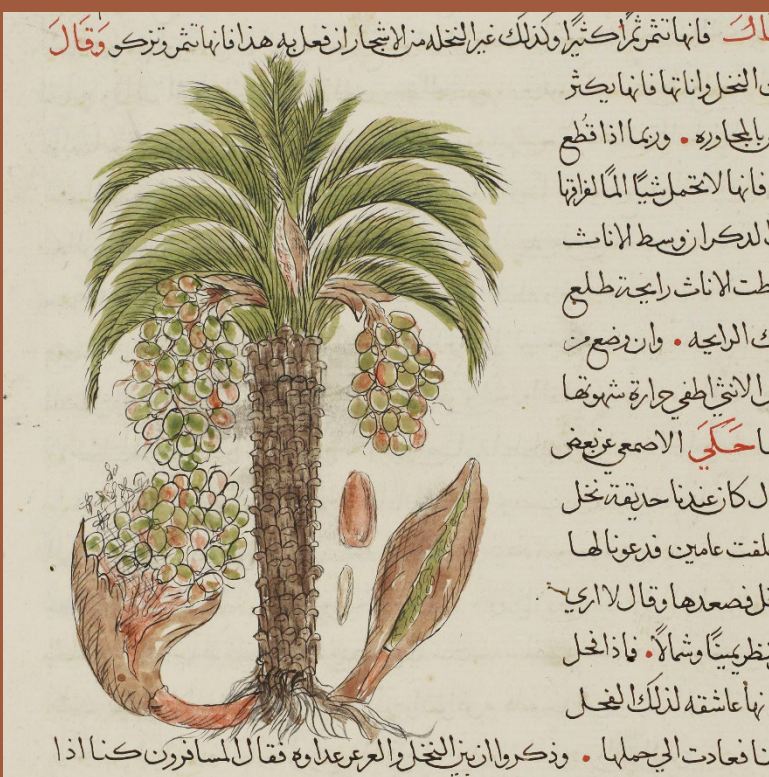
Image: Date Palm, al-'Umari, Masalik al-Absar, University of Pennsylvania US 477, fol. 69r

AKPIA Fellow; Assistant Professor, Özyeğin University